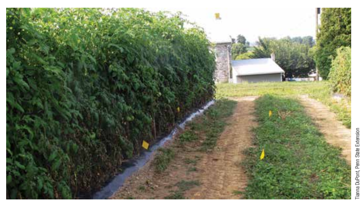
To limit risk from wildlife, every day before the crew arrives one Pennsylvania farmer takes a drive on the tractor to inspect the field. He looks for signs of deer grazing or tracks, and records any signs. If he sees any animal feces or other obvious animal activity, he flags the area five feet in each direction. The crew knows from their operating procedures not to harvest in flagged areas.