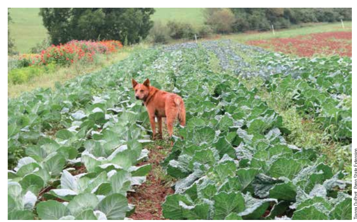
Don't allow your pets in the produce field!